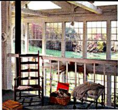
Home Sweet Barn The owners of this rural home considered buying and restoring an old barn, but decided on a timber-framed addition instead.