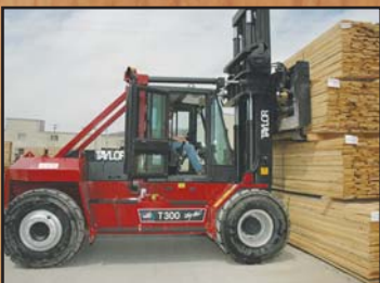
This is one of several Taylor forklifts Begley owns getting ready to pick up some bundles of lumber for shipment.