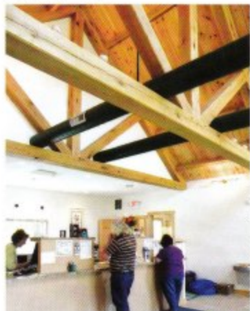
King post and strut trusses.

O akBridge Timber Framing in Howard builds handcrafted, sustainable timber frame structures using mortise and tenon joinery without any metal. Here is the 1,568-sf K & E Credit Union built in Mt. Vernon by Shrock Premier Custom Construction and designed by Ballard Architectural Studio. The project was panelized with SIPs, which allow for exceptional energy efficiency. BXM