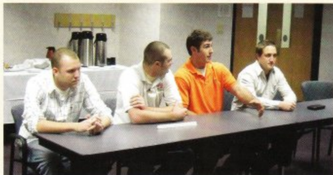
The Builders estimating competition winners.